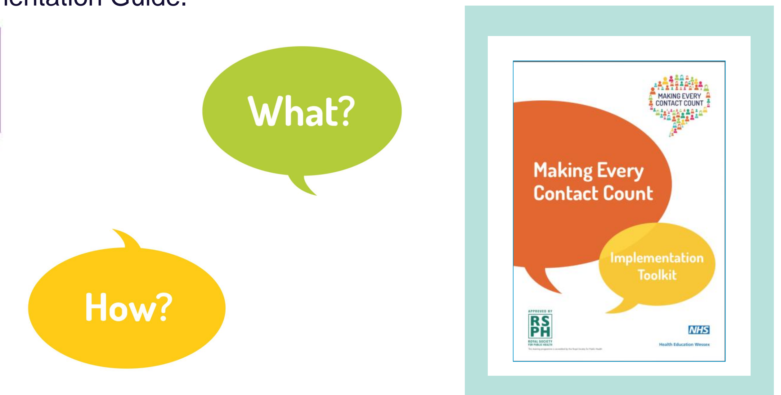
Figure 3 - The Wessex Making Every Contact Count Implementation Toolkit

Following consultation with the newly formed Wessex Making Every Contact Count Network the toolkit was launched at the national Making Every Contact Count Conference in January 2016 and has informed the national Public Health England Making Every Contact Count Implementation Guide.